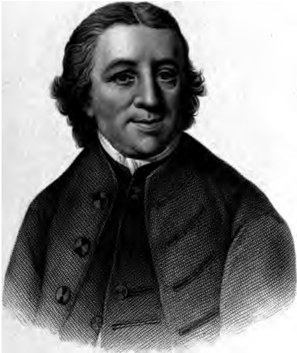
PETER BÖHMER, BISHOP OF THE CHURCH OF THE UNITED BRETHREN.